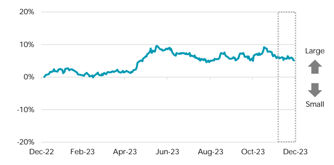
FIGURE 4. LARGE-SMALL CAP SPREAD

Note: The spread between the Russell/Nomura Large Cap Index and the Small Cap Index (Positive figure means Large Cap dominant)