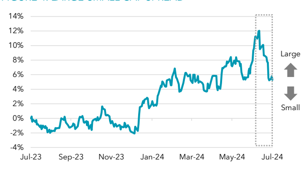
FIGURE 4. LARGE-SMALL CAP SPREAD

Note: The spread between the Russell/Nomura Large Cap Index and the Small Cap Index (Positive figure means Large Cap dominant)