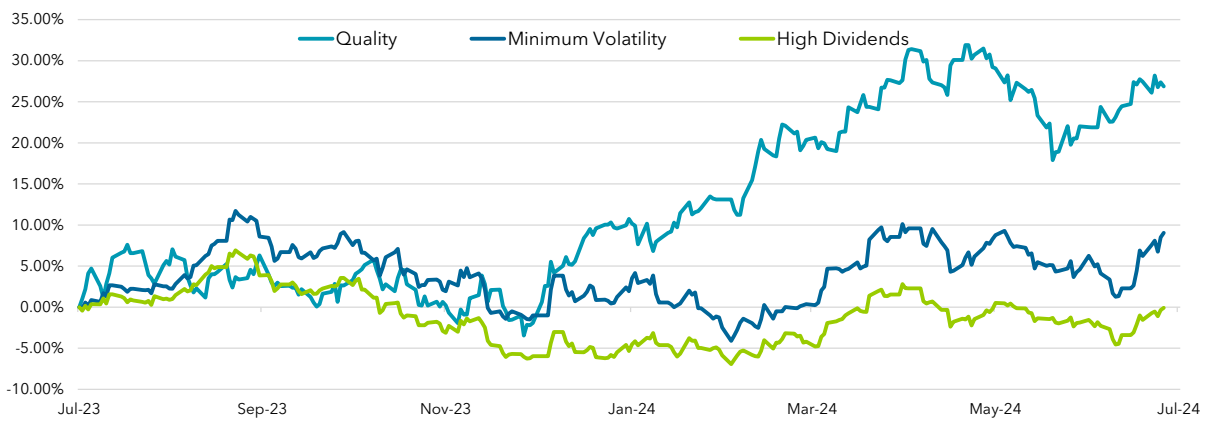
FIGURE 5. MSCI JAPAN FACTOR INDEXES SPREAD AGAINST MSCI JAPAN*

Note: The spread between the Russell/Nomura Large Cap Index and the Small Cap Index (Positive figure means Large Cap dominant)