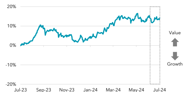
FIGURE 3. VALUE-GROWTH SPREAD

Note: The spread between the Russell/Nomura Value Index and the Growth Index (Positive figure means Value dominant)